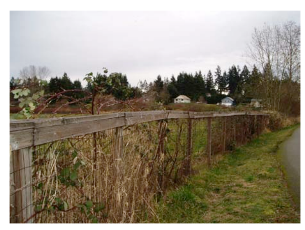
Lake Hills Greenbelt