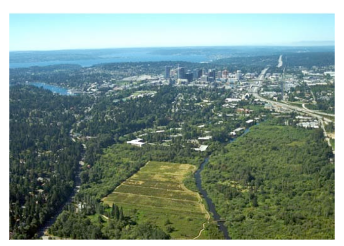
Mercer Slough Park

The ideal candidate should have previous planning knowledge and experience with light rail / Transit Oriented Development (TOD). The ideal candidate will have strong leadership abilities and will be able to make strategic decisions pertaining to staff and procedures within the organization.