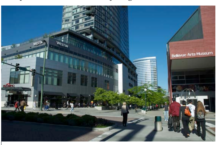
Downtown Pedestrian Corridor