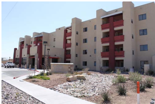
Alamito Terrace Mid-Rise

The mission of the Housing Authority of the City of El Paso, TX is to provide safe, decent and affordable housing for assisted families at or below 80 percent of area median income.