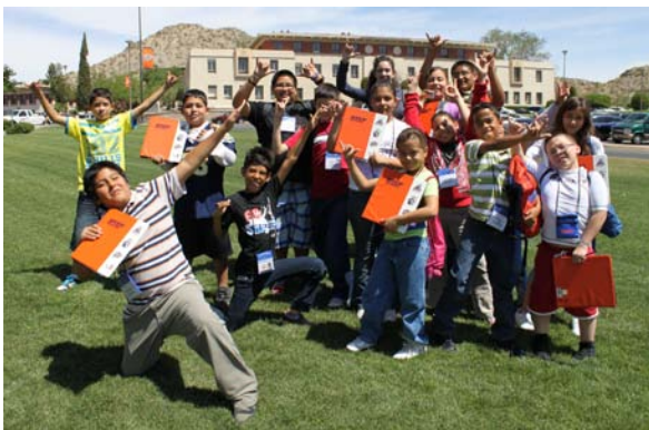
Picks Up on Campus!