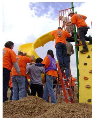
KaBOOM! Playground at Eisenhower