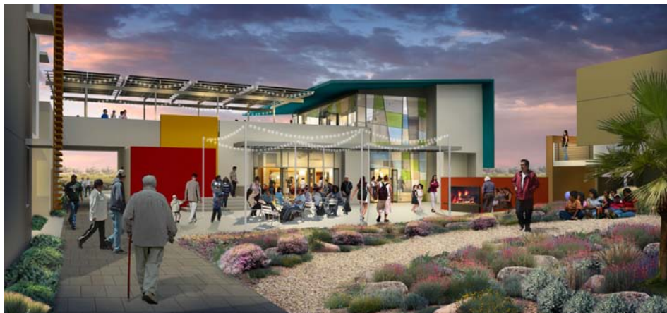
Paisano Green Community 2

Their ambitious construction and modernization program ensures that all of their properties meet or exceed the Department of Housing and Urban Development's housing quality standards. Many of their developments represent some of the best housing stock in El Paso.