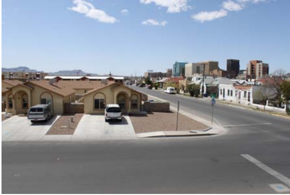
Alamito Homes and El Paso Downtown